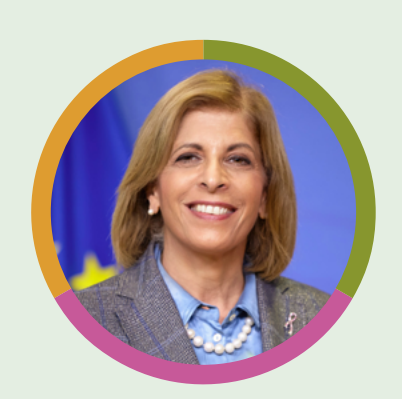
Stella Kyriakides European Commissioner for Health and Food Safety

In her position as Minister of Health, Ms. Lenert believes in equitable access to healthcare for all and opposes the privatisation of the healthcare system.