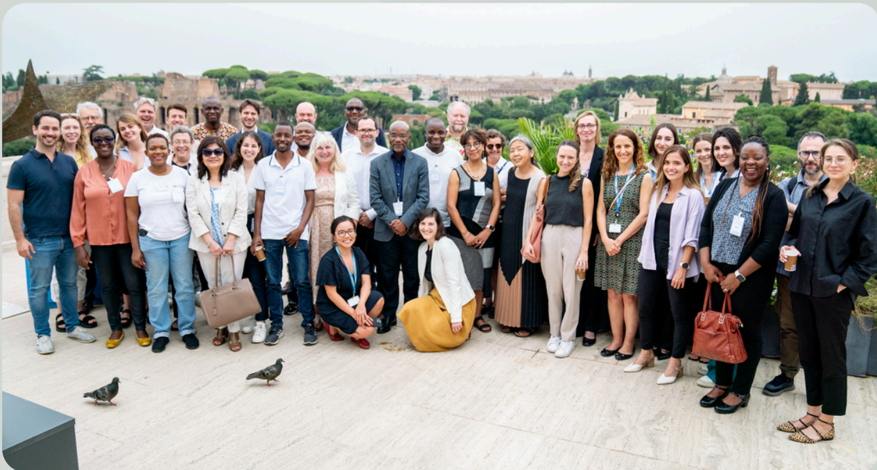
Participants at the SWM Programme, Legal Diagnostic Tool Validation Workshop in Rome