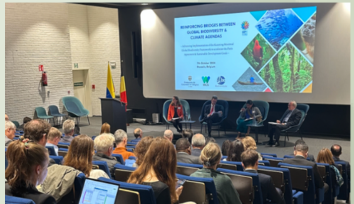
Speakers and the audience at the pre-COPs event in Brussels

In the run-up to the sixteenth session of the Conference of the Parties to the Convention on Biological Diversity (CBD COP16) in Cali, WCS EU, the Embassy of Colombia in Brussels, and the Belgian Biodiversity Platform hosted a pre-COP16 event on October 7th in Brussels to discuss the integration of global frameworks and international commitments to achieve policy goals and biodiversity gains. Read more