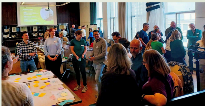
Participants at the workshop on 'Reframing the Exotic Pet Trade in Europe'.