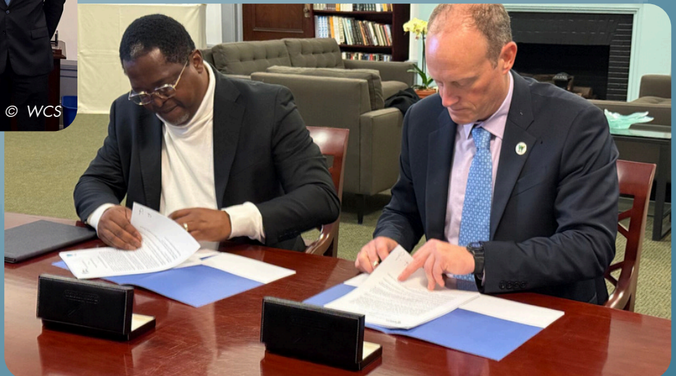
Signing ceremony between WCS and ANPN leadership.