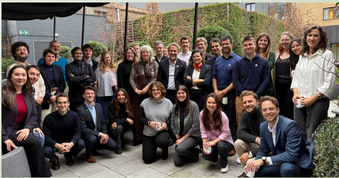
Participants of the workshop 'Coordinating Ocean-Climate Efforts in the European Union'.