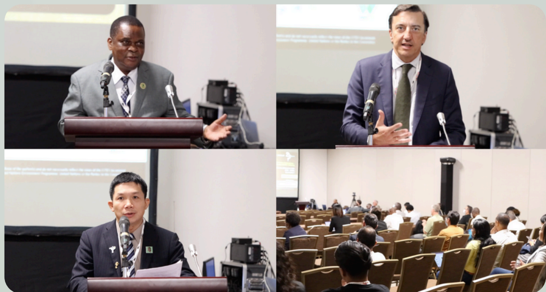
High-level speakers and the audience at the CITES COP19 side event on tackling wildlife trafficking