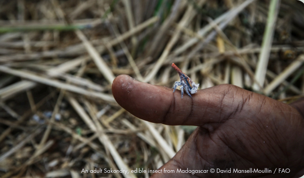
An adult Sakondry, edible insect from Madagascar