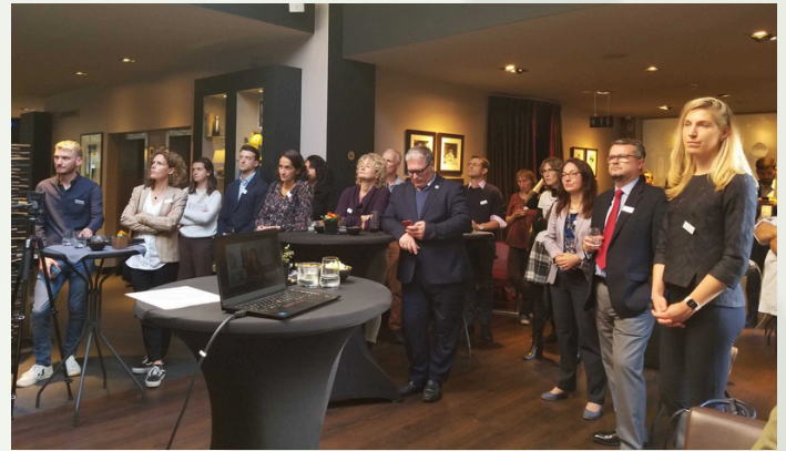
Participants at the One Health Reception in Brussels

Reception 'One Health and Pandemic Prevention' WCS EU, the Belgian One Health Network, the PREZODE Initiative, and the Czech Presidency of the EU Council organised on September 19th a special reception to discuss the importance of the One Health approach and the critical need to include 'prevention at source' in the new WHO instrument to strengthen pandemic prevention, preparedness and response. Read more