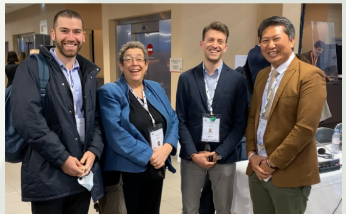
WCS team at the CITES Standing Committee meeting in Lyon

A small WCS team attended the CITES Standing Committee (SC74) meeting on March 7-11 in Lyon, France. SC74 was especially noteworthy since it was the last CITES meeting before the 19th meeting of the Conference of the Parties (COP19) to CITES, which took place in November in Panama. Read more