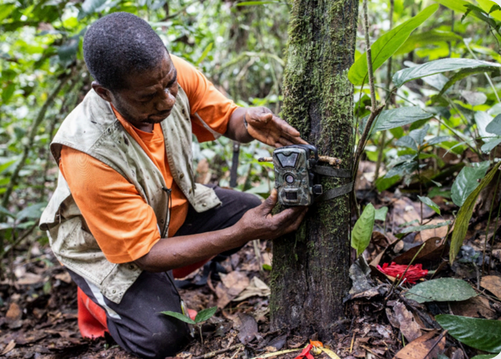
Ecological monitoring is among the various contextual studies established by the SWM programme. Here, it is being conducted within the hunting zone of the Eboyo-Bapukeli community, located in the Okapi Wildlife Reserve in DRC

On 25th September 2019, the partners of the SWM Programme gathered in Brussels for the second Steering Committee meeting.