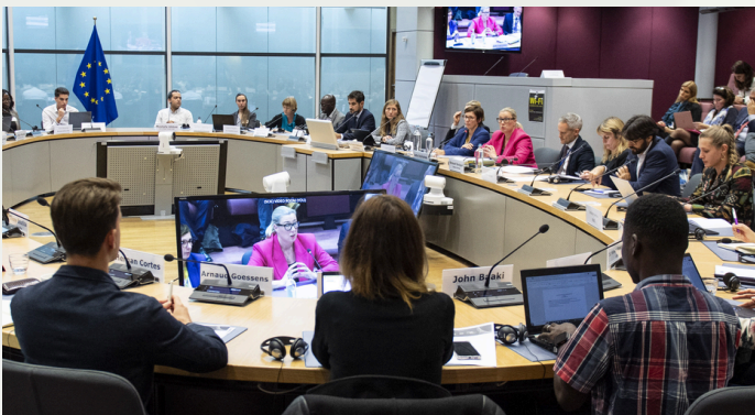
First Global Gateway Dialogue Platform meeting held in Brussels