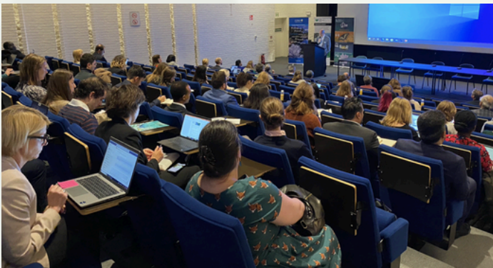
Speakers and the audience at the GBF workshop in Brussels

WCS EU, the Belgian Biodiversity Platform, The Nature Conservancy, and the IUCN World Commission on Protected Areas organised a Technical Workshop on 'Implementing the new Global Biodiversity Framework (GBF): Making Target 3 work for People and Nature' on 15th May at the Royal Belgian Institute of Natural Sciences in Brussels. Read more