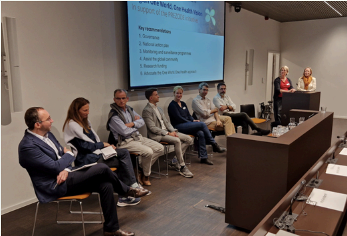
Speakers at the Belgian 'One Health Vision' Final Workshop