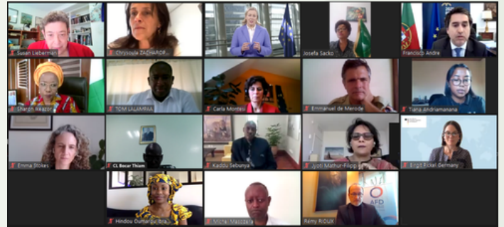
Speakers at the virtual high-level conference on the Africa-EU Partnership

On 17th March, Dr. Chrysoula Zacharopoulou, European Parliament Rapporteur for the new EU-Africa Strategy, in partnership with WCS EU, organised a virtual high-level conference titled "Addressing the Biodiversity Crisis: The Role of the Africa-EU Partnership". Read more