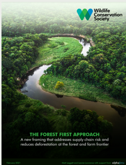
The Forest First approach report

On 26th February, and following a webinar organised in December 2020, WCS published a report titled 'The Forest First approach: A new framing that addresses supply chain risk and reduces deforestation at the forest and farm frontier', which provides a comprehensive overview of WCS's Forest First Approach. WCS also developed a brochure alongside the report which presents some case studies from WCS's work in the field. Read more