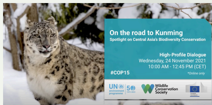
Flyer of the event 'On the road to Kunming'

On 24th November, WCS and the United Nations Environment Programme (UNEP), with the support of the European Commission, organised a high-profile dialogue 'On the road to Kunming - Spotlight on Central Asia's Biodiversity Conservation'. The event highlighted examples of positive initiatives taking place across the region thanks to partnerships built between civil society organisations, governments, communities, and businesses. Read more