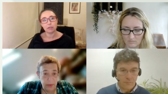
Speakers at the webinar on Ecosystem Integrity

On 14th December, the Finnish Ministry of Environment, the Belgian Biodiversity Platform, the International Coral Reef Initiative (ICRI), and WCS EU organised an informal exchange with EU officials and stakeholders regarding Ecosystem Integrity and its role in the post-2020 Global Biodiversity Framework (GBF). The full spectrum of integrity was addressed, from highly intact forests and coral reefs to semi-natural productive landscapes and seascapes. Read more