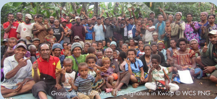
Group picture following FPIC signature in Kwiop