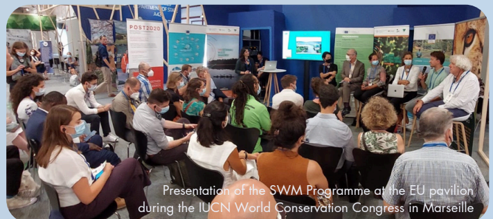
Presentation of the SWM Programme at the EU pavilion during the IUCN World Conservation Congress in Marseille