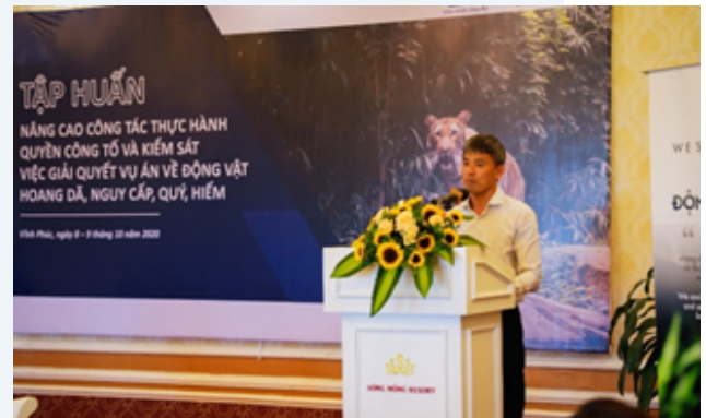
The representative of EUDEL Vietnam delivering the opening speech

In 2021, the project proceeded with a post-training evaluation, seeking to assess behaviour change and measure direct results, if any. The evaluation gathered, for a majority of participants, expressions of positive and significant change in Confidence, Attitude, Knowledge, Skills and Practice. Most respondents were applying what they had learned during the course.