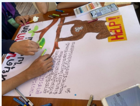
Youth creating campaign posters against poaching and trade of tiger and gibbon in violation of the Wildlife Conservation Act. #1362 is DNP's Hotline number to report wildlife crime