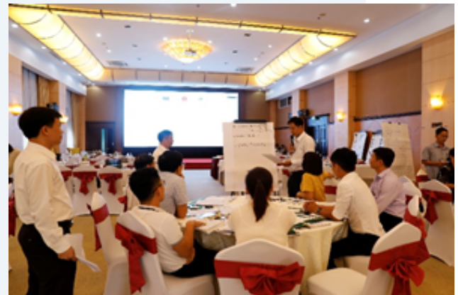
Group exercise during the first training course