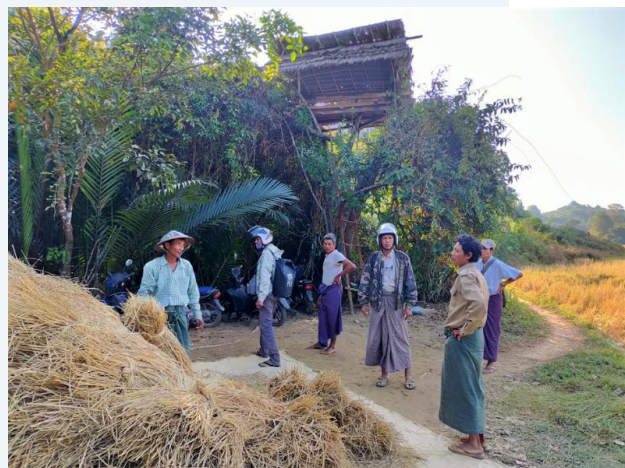
Community guardians standing by an elephant watch-tower used for HEC mitigation

The project partners are working together to enhance local awareness and participation in conservation, increasing strategic protection through community rangers and community guardians, and coordinating closely with local conservation partners. Partners aim to combat wildlife crime and reduce human-elephant conflict (HEC), whilst supporting livelihood security for communities around RYER.