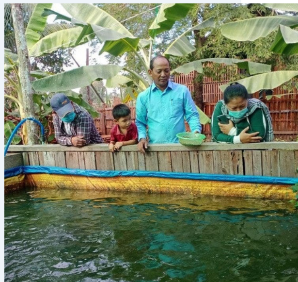
Checking on the family fish pond in the Mekong river project site

In Cambodia, the project works with model farmers living along the Sre Ambel and Mekong rivers. They receive both technical training and financial support to establish a home-based, small-scale, integrated agriculture and aquaculture system. Through this support, these farmers harvest vegetable and farmed fish for family consumption, with surplus sold at local markets, generating an additional income and reducing fishing burden.