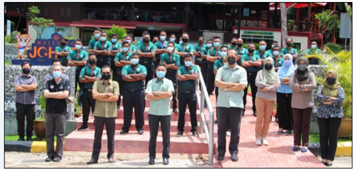
Group photo with newly recruited BP3 patrollers in Johor State

The work in Malaysia focuses on the Endau-Rompin Landscape (ERL), one of three priority areas for tigers and elephants in the country. The recent government initiative 'BP3' has enabled dozens of new patrol teams to be deployed nationwide, made up of indigenous people supported by veteran armed forces personnel. This program is one of the most significant initiatives for on-the-ground protection of wildlife in the country, sorely needed to curb the threat of poaching, especially by Indochinese syndicates.