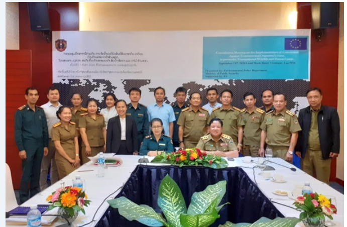
Consultation meeting with Lao's CWT enforcement agencies DCNEC and DOFI

In April 2021, enforcement agencies in Savannakhet province arrested one suspect and confiscated elephant ivory, based on intelligence information from open-source social media research. The case resulted in a successful prosecution and court decision.