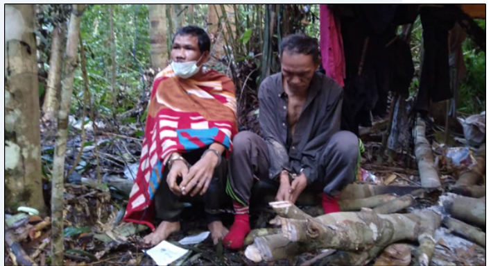
Two Cambodian agarwood poachers arrested following BP3 patrol report