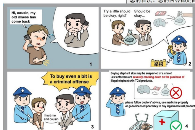
Design of one of the series of trial intervention posters to be used to evaluate influence of messaging in elephant skin consumption

下面我们会给您看一幅漫画，看完以后，我们会问一些有关漫画的问题和您的看法。您的回答都是匿名的。