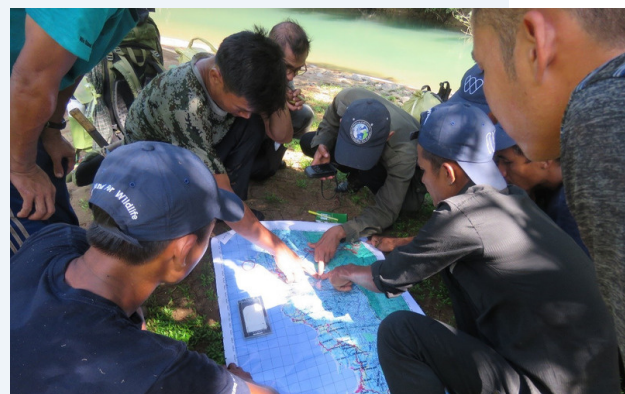
Discussions among community rangers for patrol planning